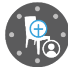
Christ in life & on

Are you willing to give all of yourself to God? _____