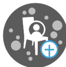
Christ in life / Self on throne